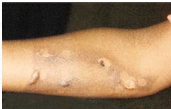
A steam iron was used to inflict injury on this child.