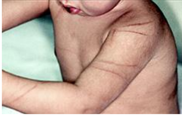
Regular patterns reveal that a looped cord was used to inflict injury on this child.