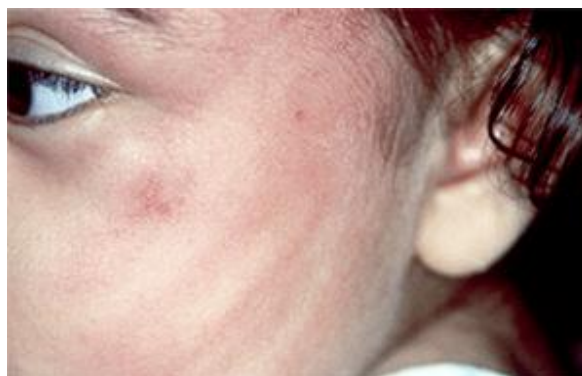
This pattern signals the blow of a hand to the face of a child.